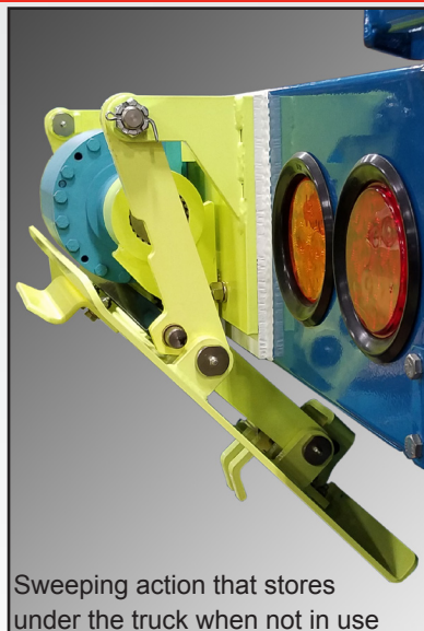
Sweeping action that stores under the truck when not in use