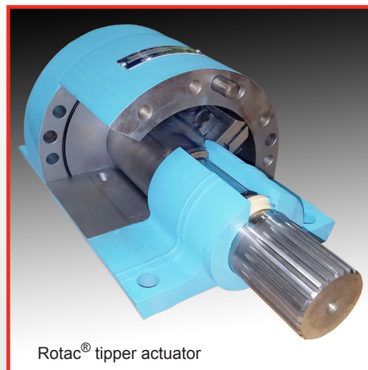
Rotac ® tipper actuator

Micromatic makes the only cart tipper using our Rotac ® rotary vane actuator One moving part means increased durability and easy service